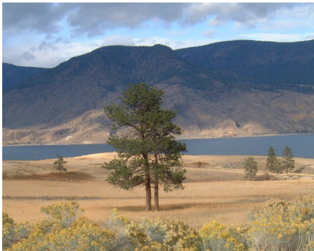
Grasslands Conservation Council of British Columbia, June 30, 2005